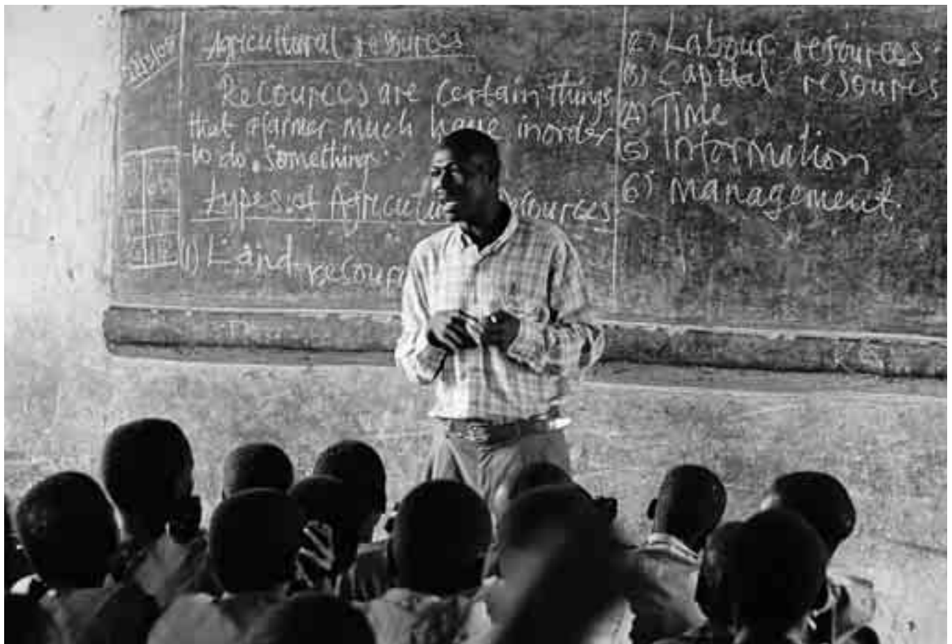
Classroom at Bweyde Primary School, Uganda

The five case studies and the lessons learned during the implementation of the projects provide valuable insights for CSOs, development agencies and governments in developing countries that are implementing similar programmes of education budget work. The case studies illustrate how CSOs advocating for children’s right to basic education can use budget work as a tool to hold their governments accountable for their commitments, and to demand transparency and improvement in service delivery.