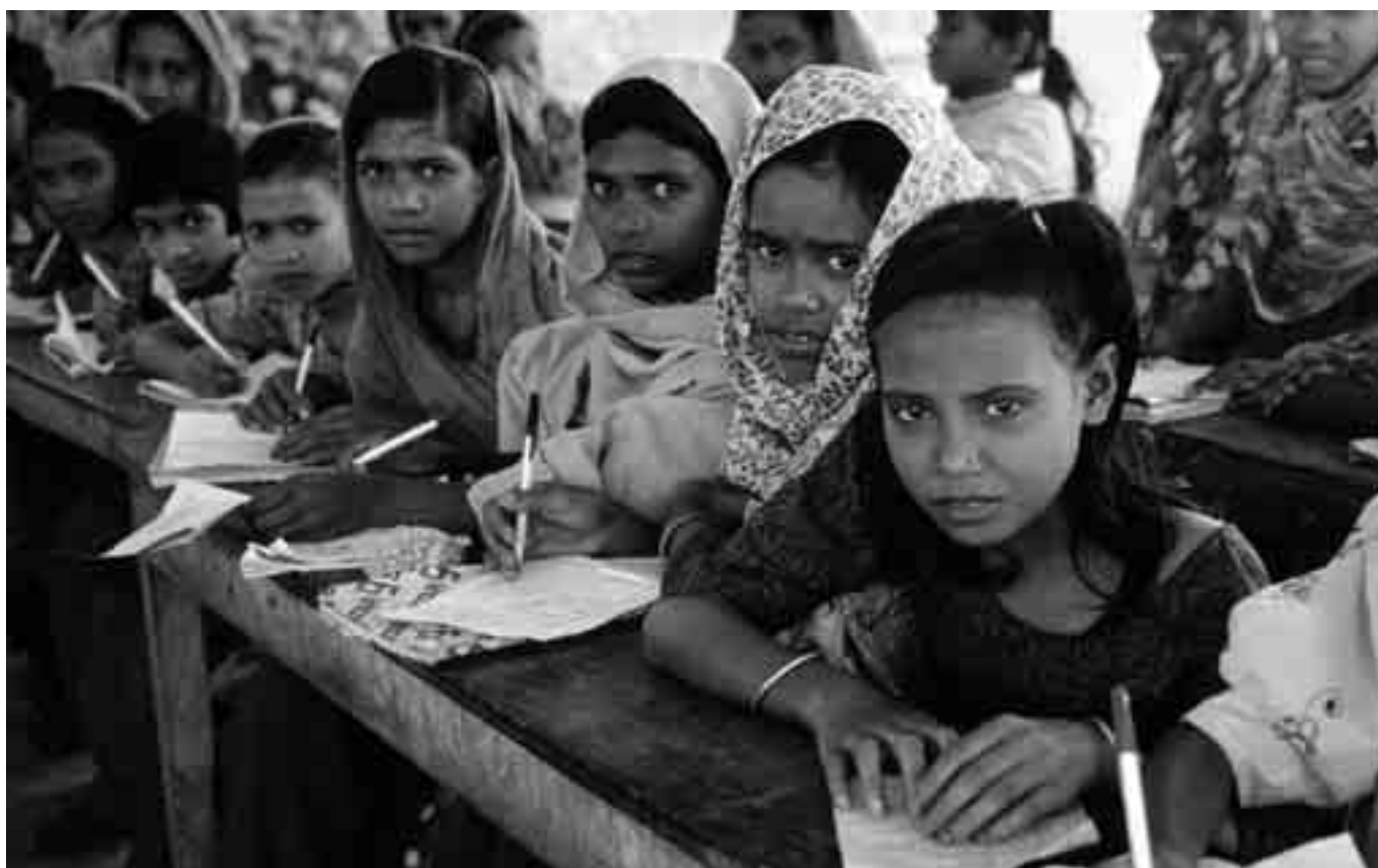
Girls at government school in Char Kukri Mukri, Bangladesh

The community audit groups investigated the PEDP II plans and budgets to verify whether expenditures were made at school level. The areas of focus included the development of water and sanitation facilities, and building new classrooms and teaching materials. They also investigated the involvement of school management committees in