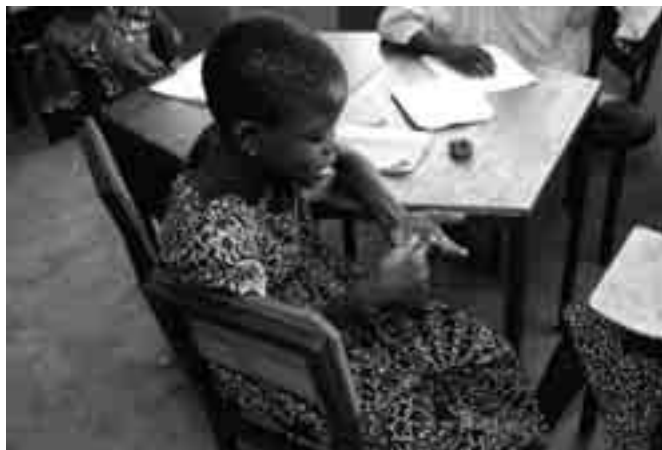
Child in class at the Tizaa Centre, Ghana

budget. Budget information relating to allocations and expenditure on textbooks and other learning materials was used to monitor school budgets